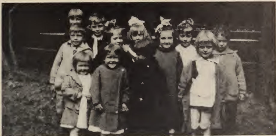
A NORTH DAKOTA JUNIOR AUXILIARY